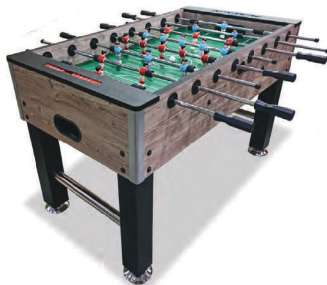
KPITGD 5 FEET DELUXE SOCCER TABLE (TEAK FINISH) L 142 X B 80 X H 17 CM