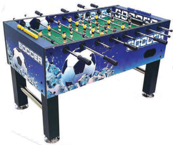
KPITGE 4 FEET DELUXE SOCCER TABLE L 140 X B 74.6 X H 88 CM.