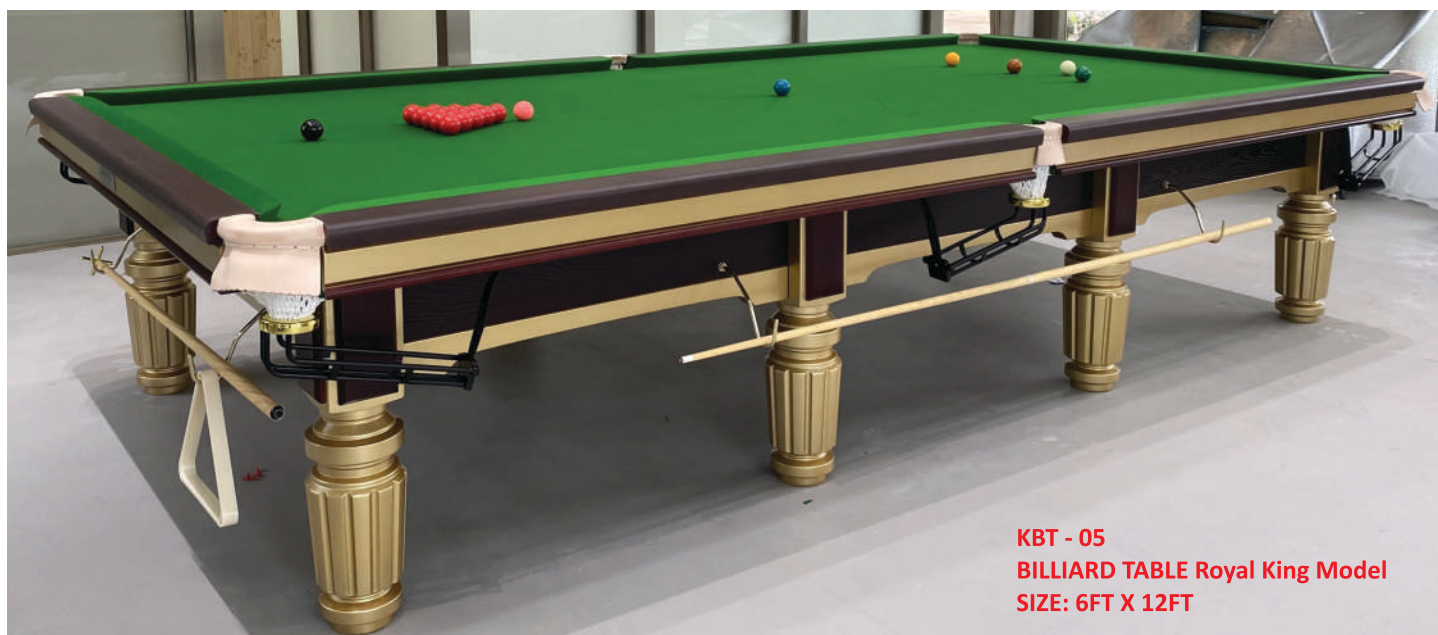
KBT - 05 BILLIARD TABLE Royal King Model SIZE: 6FT X 12FT