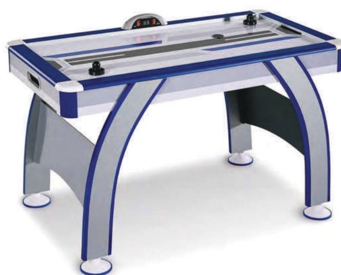
KPITGF 5 FEET ELECTRONIC AIR HOCKEY L 140 X B 74 X H 82 CM.