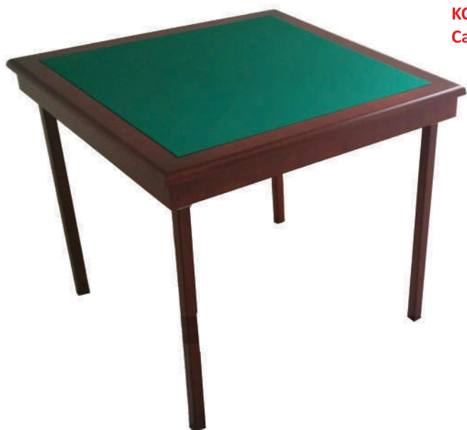
KCT01 Card Table Square