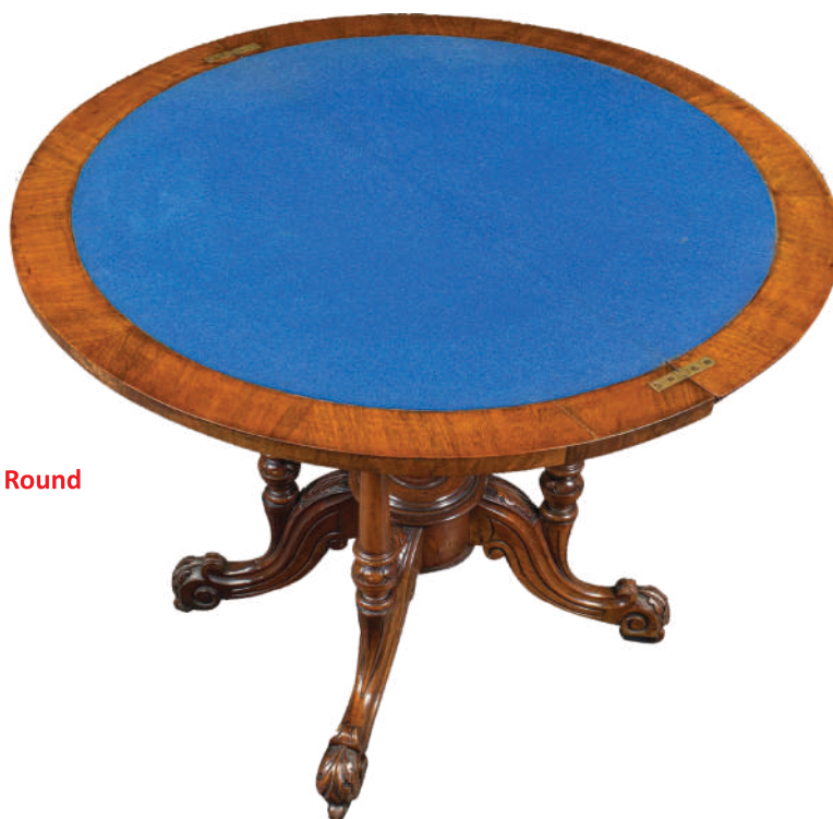
KCT02 Card Table Round