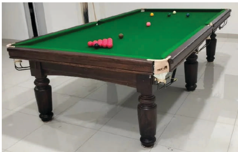
KBT02 BILLIARD TABLE Standard Model SIZE: 6FT X 12FT