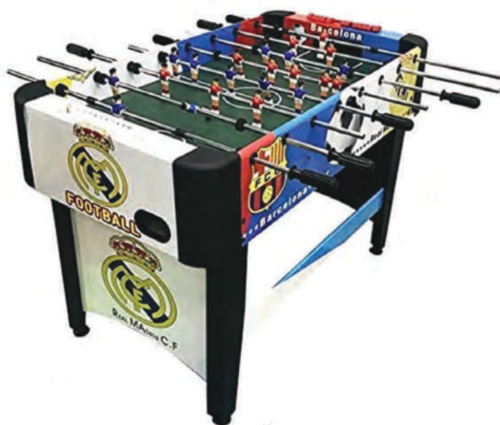
KPITGC 4 FEET SUPERIOR SOCCER GAME L 120 X B 61.2 X H 78 CM