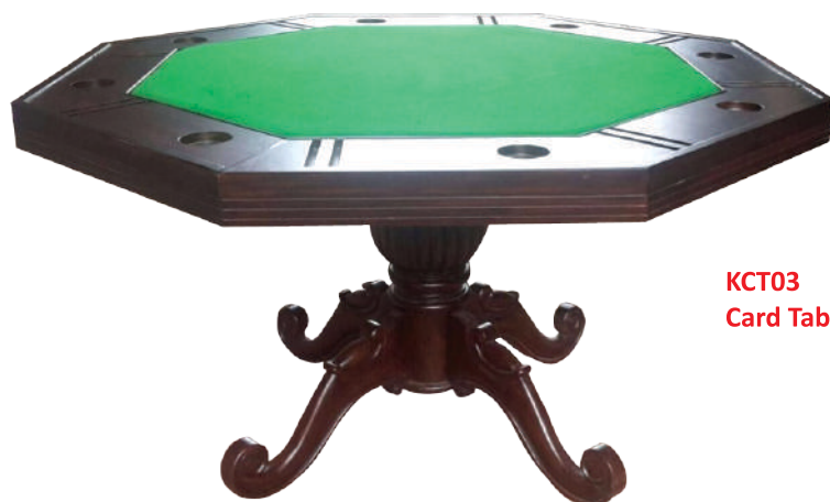
KCT03 Card Table Hexagonal