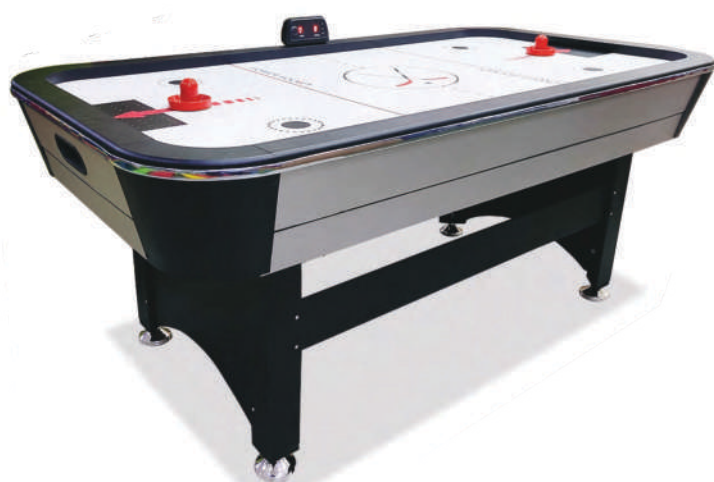
KPITGG 6 FEET ELECTRONIC AIR HOCKEY L 190 X B 105.5 X H 19 CM.