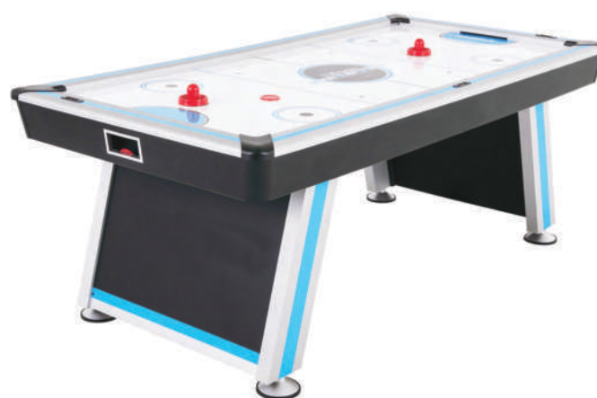
KPITGG 7 FEET SUPER AIR HOCKEY L 215 X B 108 X H 81 CM.