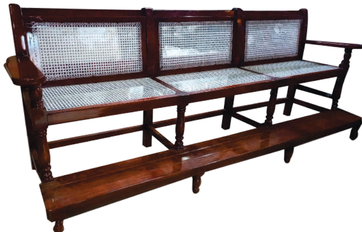
KSC - 1 OFFICIAL SITTING CHAIR FOR POOL AND BILLIARD TABLE SIZE: 3MT X 1MT X 1.20MT MADE OF HARD WOOD WITH HAND WEAVED SITTINGS OVER ONE STEP OVER