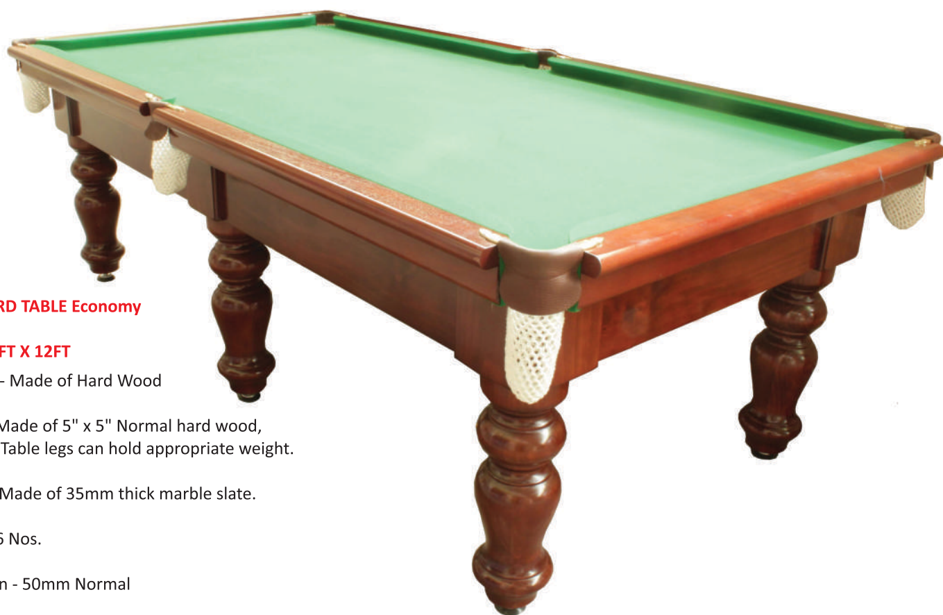
KBT01 BILLIARD TABLE Economy Model SIZE: 6FT X 12FT